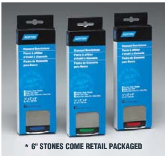
* 6" STONES COME RETAIL PACKAGED