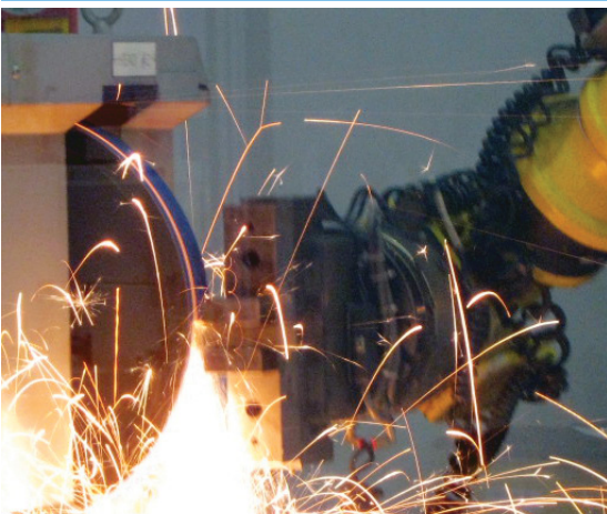
304 SS Stock Removal